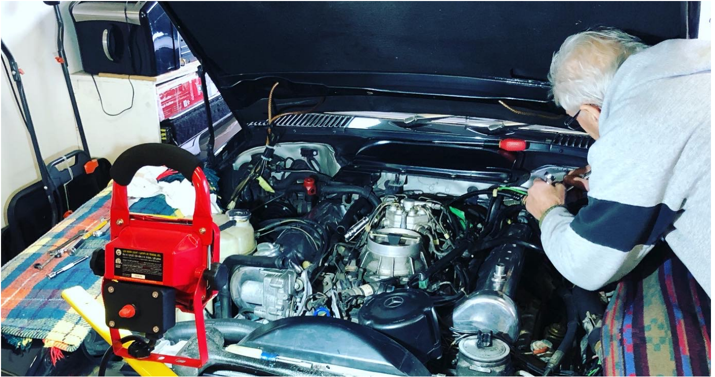
Making modifications to an R107. New valve covers and custom brackets for the air filter housing. See p6.