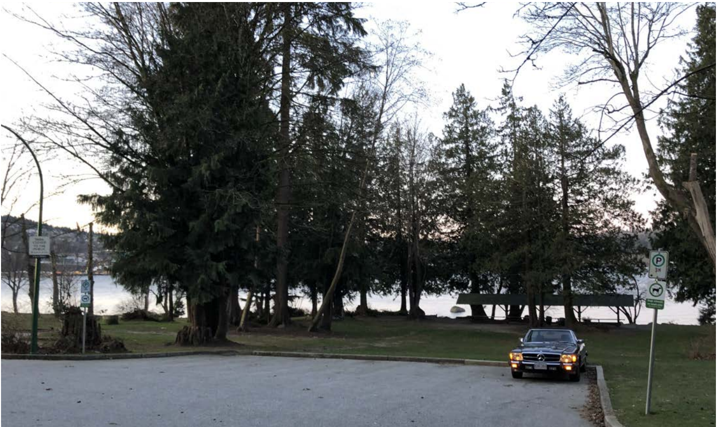
What's a club member to do? Driving events in a time of COVID-19. See p12.